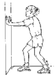
Heel Cord Stretch (Achilles Tendon)